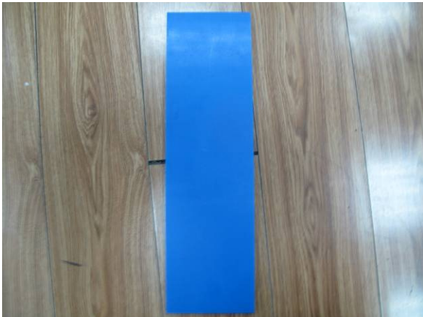
Before Flammability test